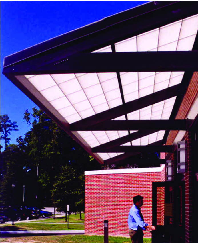
Self-Supporting Awning Design