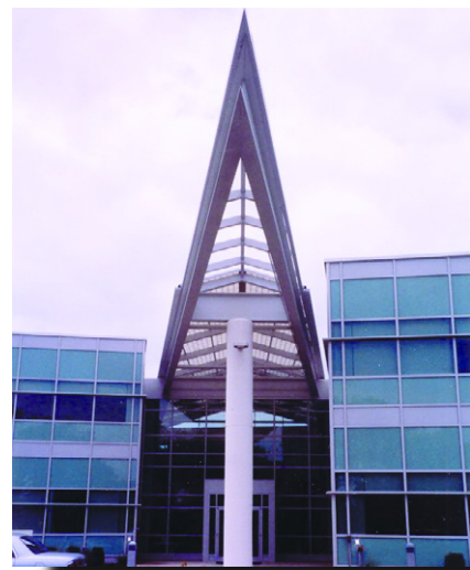
Custom Ridge-Type Skyroof™

The structural integrity of Structures Unlimited, Inc. canopies, awnings and walkways is ideal in any climate ... stands up to desert sands, hurricane-force winds and arctic cold like no other material or system can.