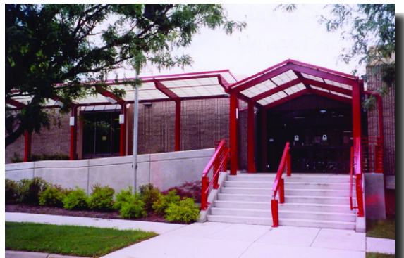
Cantilever and Ridge Combination