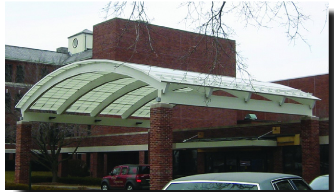
Segmented Skyroof™ with Custom-Tapered, Curved Structure

The structural integrity of Structures Unlimited, Inc. canopies, awnings and walkways is ideal in any climate ... stands up to desert sands, hurricane-force winds and arctic cold like no other material or system can.