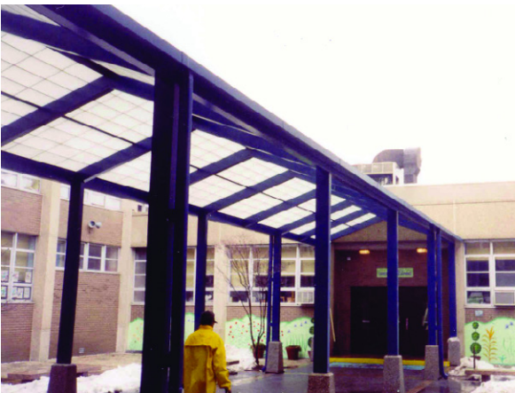
Center Ridge Design Walkway

Pre-engineered structures are ideal for linking buildings or providing weather protection. Structures Unlimited, Inc. is your single-source supplier for lightweight, low-maintenance structures. Diffuse, natural daylight can fill any area with glare-free, shadowless illumination.