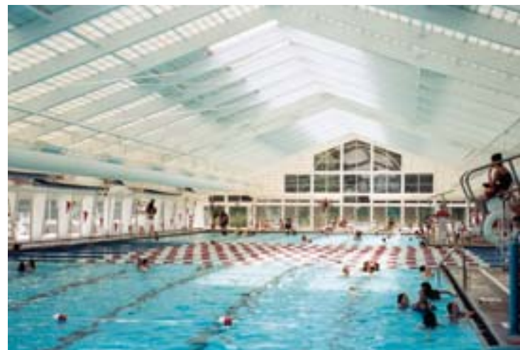
• Military facilities • YMCAs • Fitness clubs