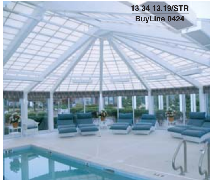
• Active-adult communities

Want to enjoy the outdoors? Simply turn a switch and let the sun – or moon – shine in. Our operable skylights are simple, affordable and reliable.