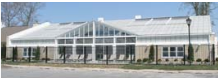
• Hotels and resorts • Private residences