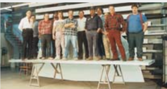
This is NOT possible with competitive systems!